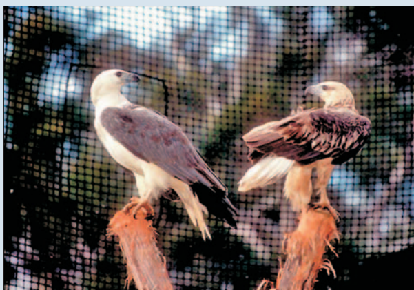
A juvenile sea eagle and an adult sea eagle during rehabilitation for release into the wild.

The TCF has allocated funding to enable the development of infrastructure for public access for education/awareness sessions on the human impact on native fauna, and for the rehabilitation and release of fauna. This includes construction of two large free-flight aviaries, individual aviaries for treatment of ill/injured birds, construction of dog and cat-proof cages for non-bird fauna, toilets and a car park. It is anticipated construction will be completed by the end of 2006.