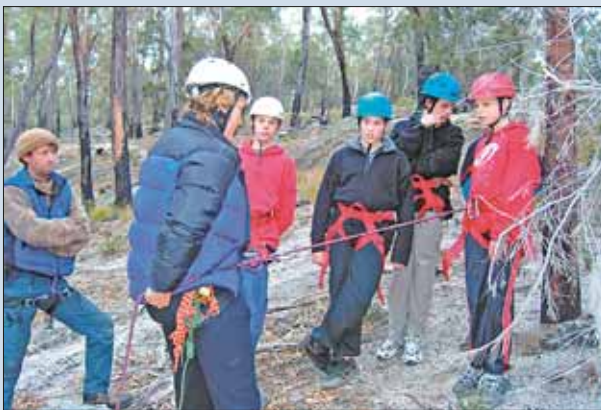
Participants on a Dooloomai camp

During their time at Dooloomai, the custodial grandchildren participated in outdoor adventure activities, such as bushwalking and abseiling.