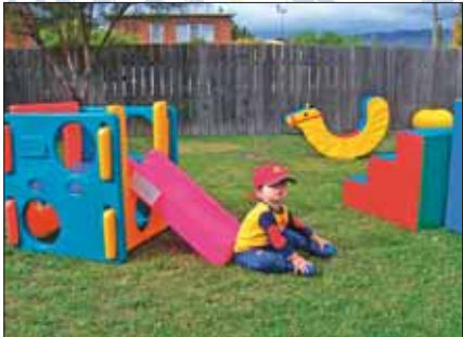
Glenora Playgroup Play Access Library. See Page 8.