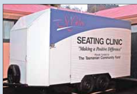
The mobile seating clinic.

St Giles was limited in its ability to service clients' wheelchairs around the state. After receiving funding for the service, St Giles has been able to work in rural and remote areas around the state, visiting the north west coast fortnightly and southern Tasmania every three weeks. Waiting time for clients to have repairs or adjustments made to their chairs has been reduced by up to four weeks. The number of clients, new referrals, repeat users and