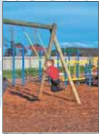
Glenhaven Family Care. See Page 12.