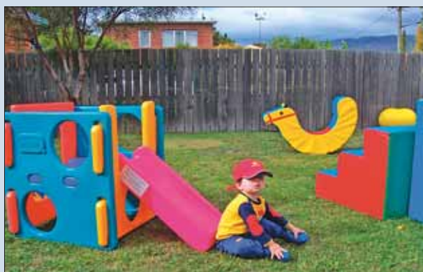
Some of the Play Access Library equipment used by a local child on site at Glenora.

The grant request arose from an identified lack of service provision for families in the area, and sought to bring communities together, promote health and wellbeing for young children, and assist parents in guiding their children's development.