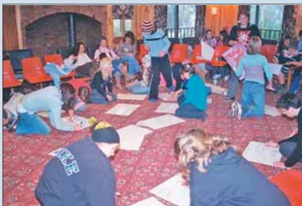
The Festival of Dreams 'Mosh Pit' – Bronte Park, May 2005.