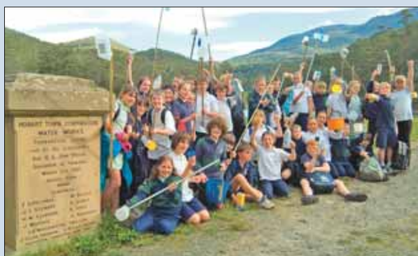
An exuberant group of Princes Street 'Water Warriors' at Waterworks reserve.

The project develops curriculum material specific to the Essential Learnings Framework. The TCF funding will be used towards salaries and on-costs for the project manager and schools' coordinator. The Tasmanian Community Foundation has also contributed $7,000 to the costs of the program.