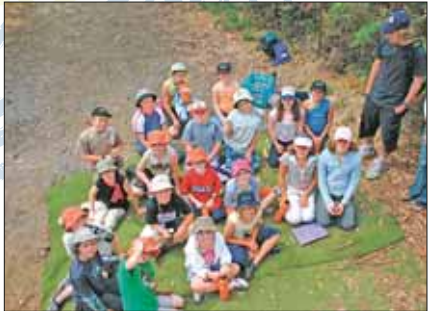
Diabetes Australia - Tasmania Camping Connections. See Page 15.