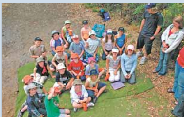
Participants at camps for children with diabetes.

The resource centre has been a valuable addition, benefiting mostly newly diagnosed people with diabetes.