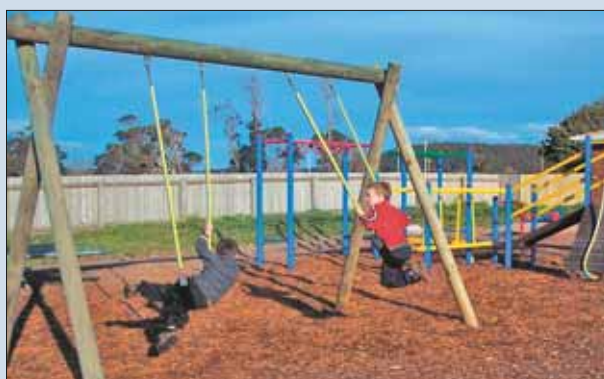
Children in the playground at Glenhaven Children's Home.

The home carers believe that the refurbishment of the home over several years using the grants from TCF has created a more homely atmosphere, particularly the large dining area which creates a wonderful family atmosphere. The playground has been an excellent entertaining facility for the children and is now